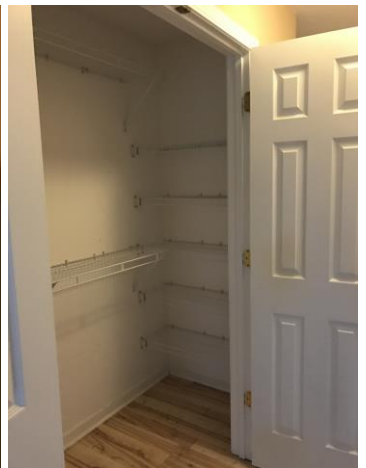
Huge Hall Closet