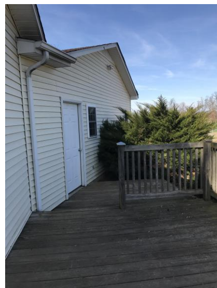
Back Deck into Garage