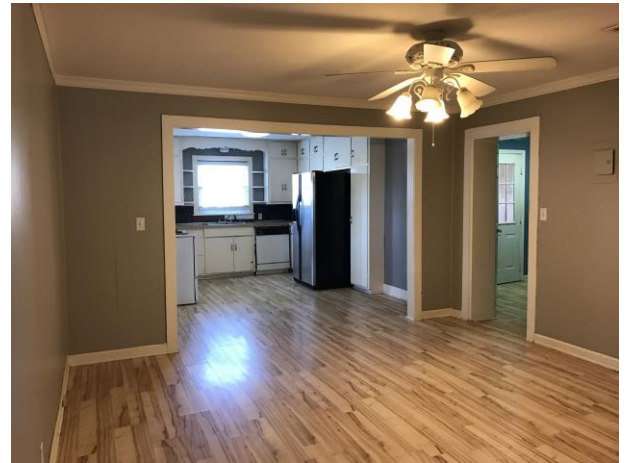
Family Room into Kitchen