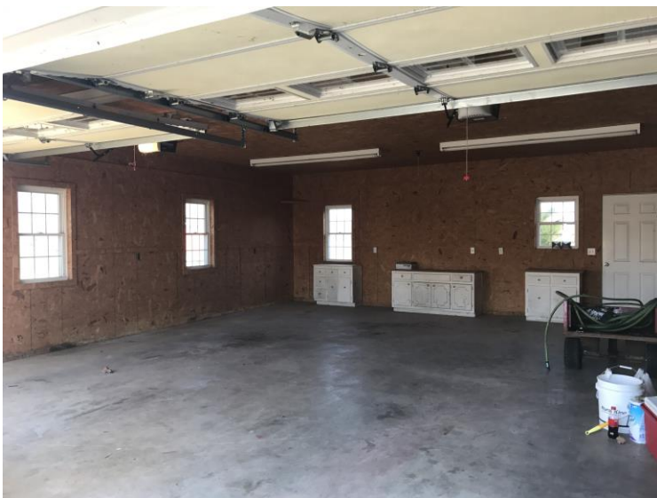
Oversized Two Car Garage