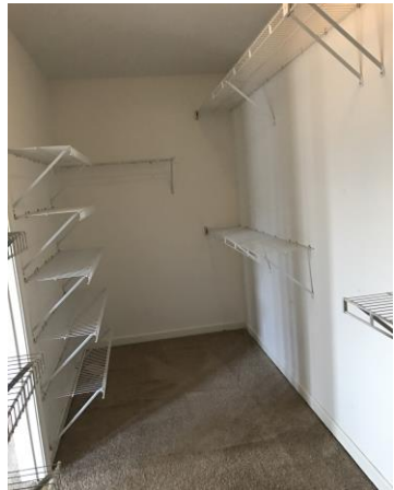
Huge Master Closet