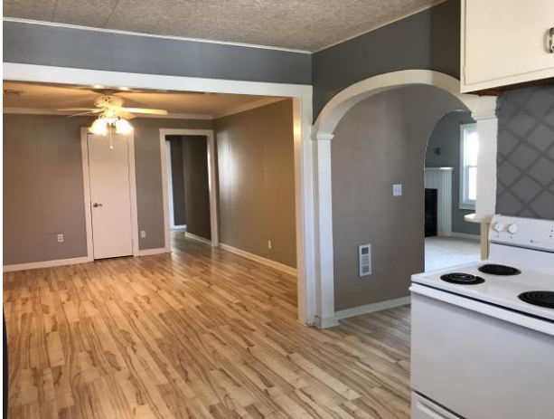
Kitchen into Family Room